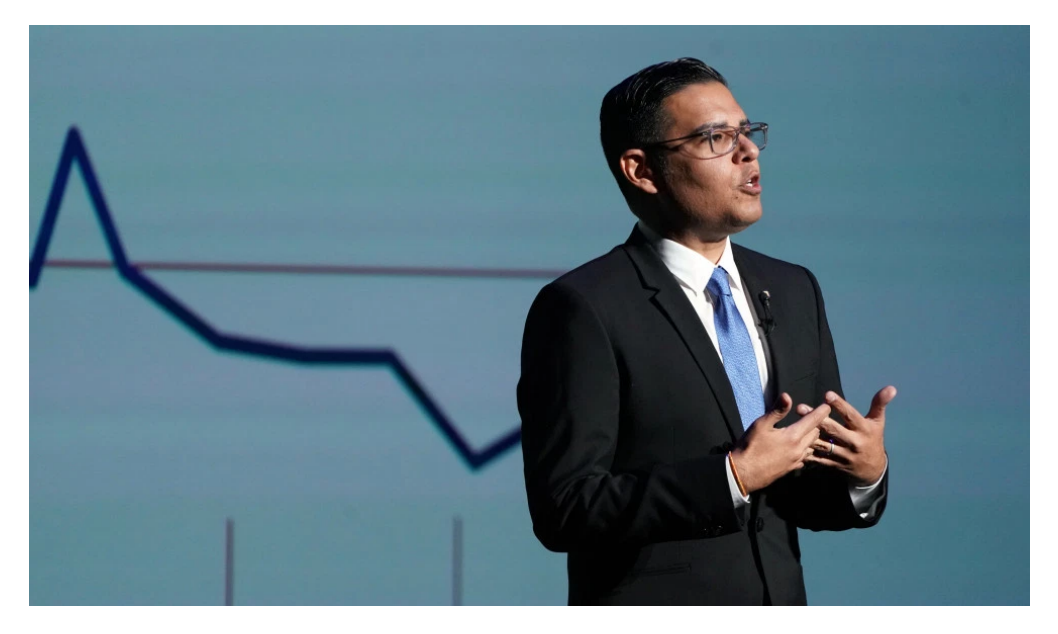
Mayor Robert Garcia

The capacity to safely provide childcare is critical to restarting Long Beach's economy.